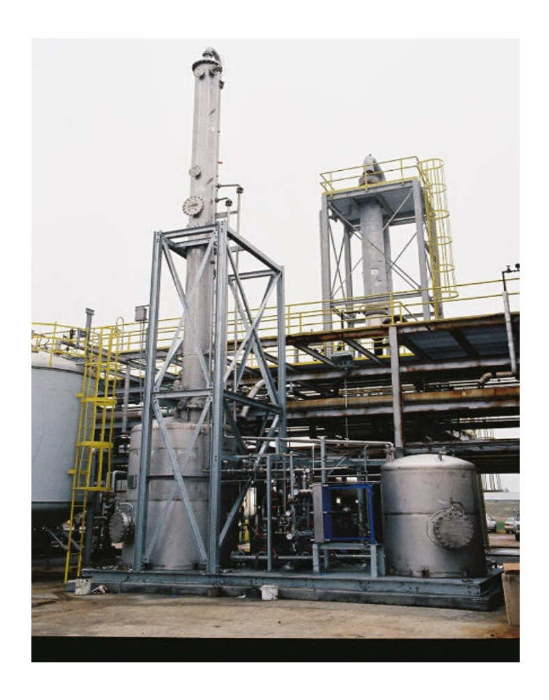
Bionomic NaHS System Installation at Ethyl Corporation

The Bionomic NaHS modular production system utilizes multistage gas absorption devices in a two- step process that offers extremely efficient sodium hydrosulfide solution production using hydrogen sulfide and sodium hydroxide as the feedstocks.